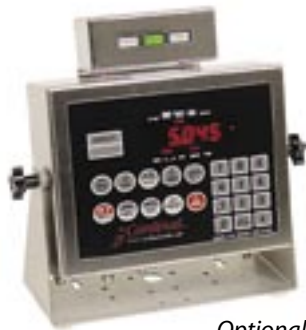
Optional Checkweigher Light Bar for Model 210