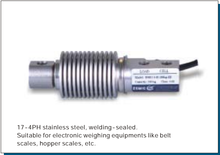
17-4PH stainless steel, welding-sealed. Suitable for electronic weighing equipments like belt scales, hopper scales, etc.